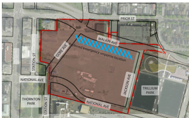
CITY OF VANCOUVER NEW STREETS & PREFERRED EMERGENCY RESPONSE LOCATION

The road network will provide for alternate routes to the emergency department, ensuring access in the event that any given street is impassable.